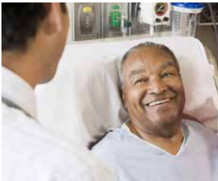
Safe for the patient

LUCAS delivers safe chest compressions for patients and responders.