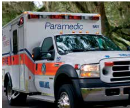
Improved safety during transit