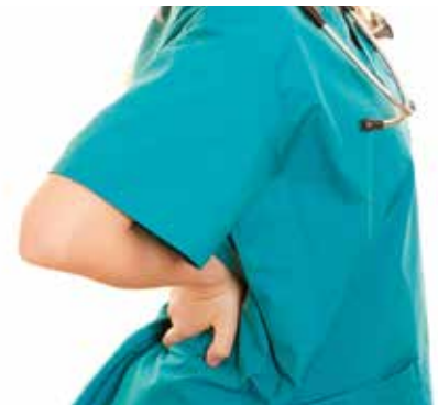
Reduced fatigue and back pain