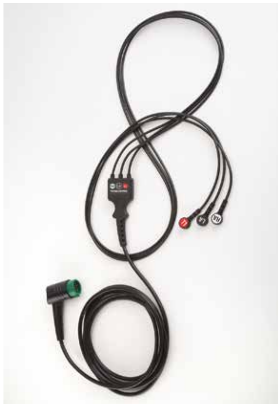
3-Wire ECG Cable 11110-000029