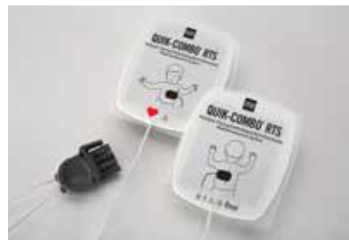
Pediatric EDGE System RTS Electrodes with QUIK-COMBO Connector

For use only with manual monitor/defibrillators; 12 month minimum shelf life at time of shipment. 11996-000093 (24" leadwire length)