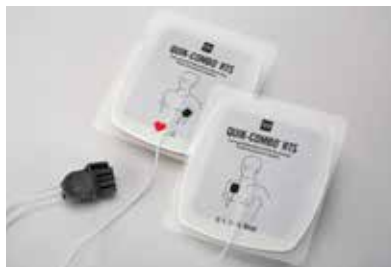
EDGE System RTS (Radiotransparent) Electrodes with QUIK-COMBO Connector