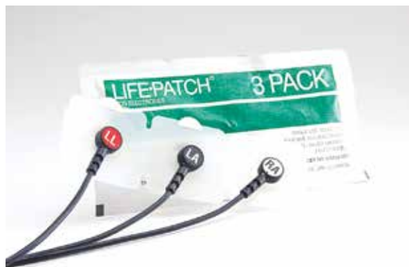
LIFE-PATCH® ECG Electrodes Adult, pregelled. 11100-000001 (3/pack) 11100-000002 (4/pack)