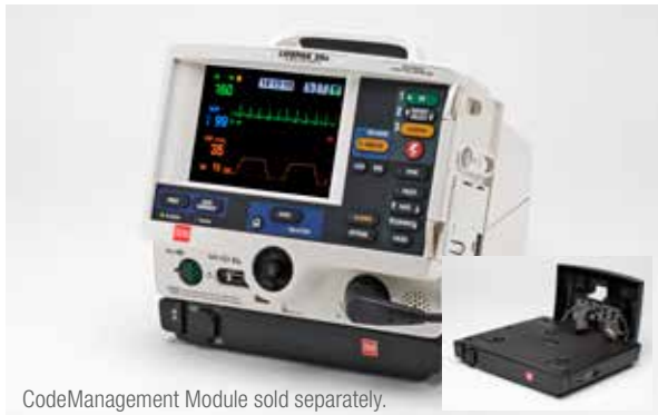
CodeManagement Module sold separately.