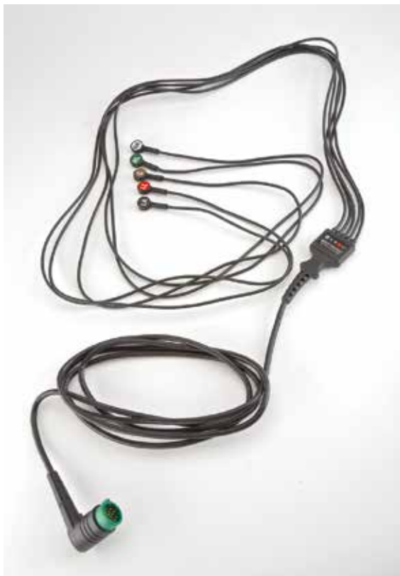
5-Wire ECG Cable 11110-000066