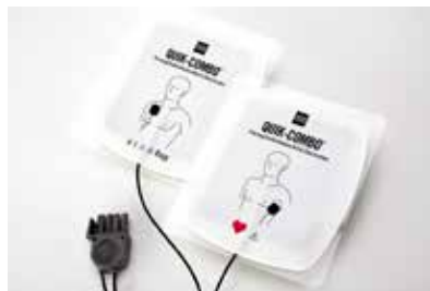
EDGE System Electrodes with QUIK-COMBO Connector

18 month minimum shelf life unless specified