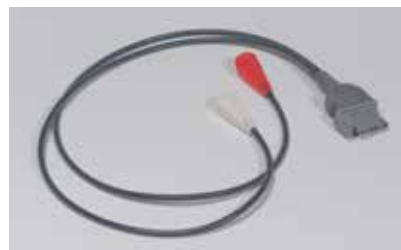
FAST-PATCH® Adapter Cable

For use with the QUIK-COMBO therapy cable 11110-000052