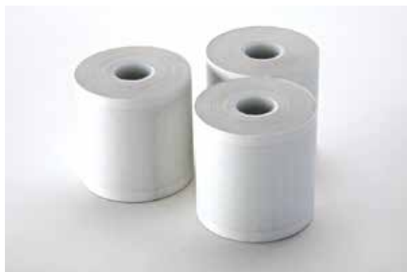
500mm ECG Printer Paper 11240-000013 (3 rolls/box)