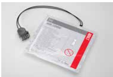
EDGE System Electrodes with QUIK-COMBO Connector and REDI-PAK™ Preconnect System

For use only with manual monitor/defibrillators; 12 month minimum shelf life at time of shipment. 11996-000093 (24" leadwire length)