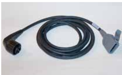
QUIK-COMBO Therapy Cable