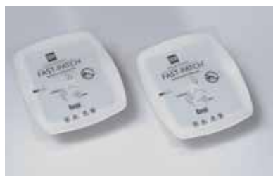
EDGE System Electrodes with FAST-PATCH Connector

Must be used with QUIK-COMBO to FAST-PATCH Adapter Cable (11110-000052) 11996-000092