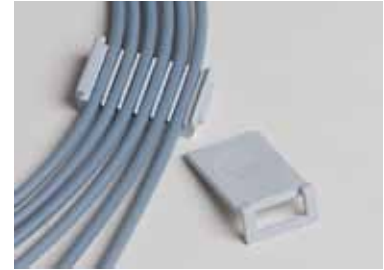
4-wire Cable Comb 21300-008054 (10/pk)