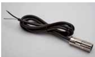
Replacement DC Input Cable 11140-000084