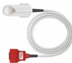
Pediatric Reusable Direct Connect Sensor