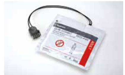
EDGE System Electrodes with QUIK-COMBO Connector and REDI-PAK™ Preconnect System