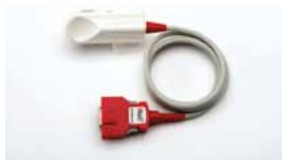
Adult Rainbow Direct Connect Reusable Sensor

11996-000335 (3ft) 11171-000032 (8ft) 11996-000336 (12ft)