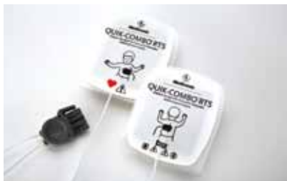
Pediatric EDGE System RTS Electrodes with QUIK-COMBO Connector

For use only with manual monitor/defibrillators; 12 month minimum shelf life at time of shipment 24 in. leadwire length.