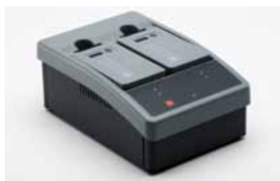
Mobile Battery Charger Includes AC and DC power cords, mounting bracket and operating instructions. 11577-000011