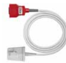
Adult Reusable Soft Direct Connect Sensor