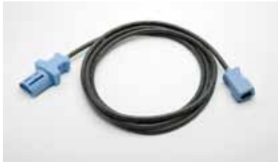
Temperature Adapter Cable