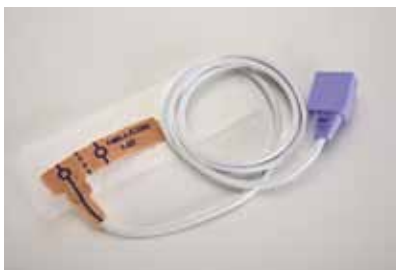
Oxisensor II (24/box) Infant 11996-000115 (18 in. - Ref# I20) Neonatal/Adult 11996-000117 (18 in. - Ref# N25)