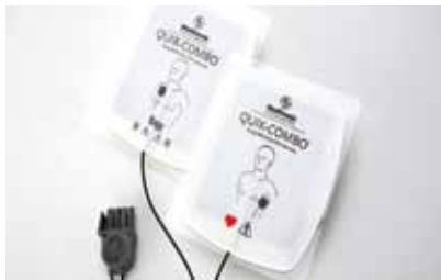
EDGE System Electrodes with QUIK-COMBO Connector

18-month minimum shelf life remaining at time of shipment from Physio-Control except where noted.