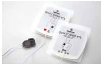
EDGE System RTS (Radiotransparent) Electrodes with QUIK-COMBO Connector