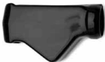
Reusable Ambient Light Shield

Connects LIFEPAK 15 to Nellcor patient sensor 11996-000365 (4ft) 11996-000366 (10ft)