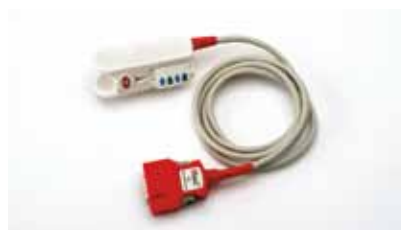
Pediatric Rainbow Direct Connect Reusable Sensor

11996-000335 (3ft) 11171-000032 (8ft) 11996-000336 (12ft)