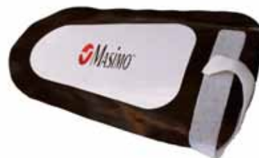
Disposable Ambient Light Shield