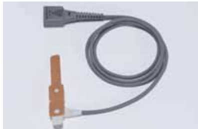
Oxiband Reusable Sensor Includes 50 disposable adhesive sensors 11996-000061 (Ad/Neo - Ref# OXI A/N) 11996-000062 (Ped/Inf - Ref# OXI P/I)