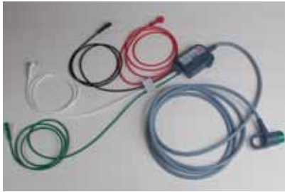
12-Lead ECG Cable Trunk Cable with 4-Wire Limb Leads 11111-000018 (5ft) 11111-000020 (8ft)