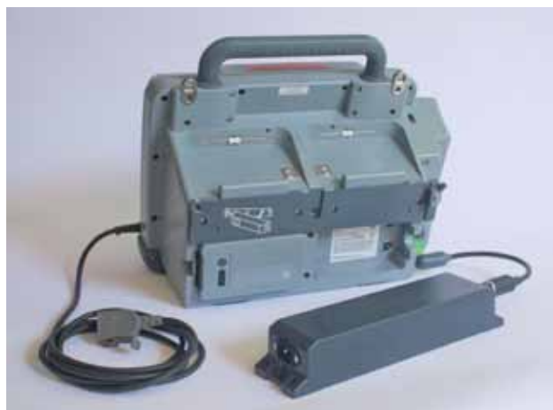
AC Power Adapter Includes Right Angle Cable (AC power cord not included) 11140-000072