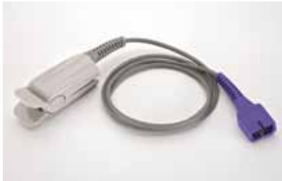
DURASENSOR Reusable Clip 11996-000060 (Adult - Ref# DS100A)