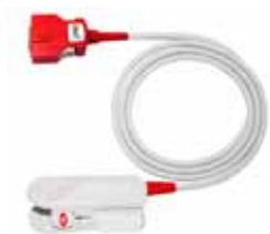
Adult Reusable Direct Connect Sensor