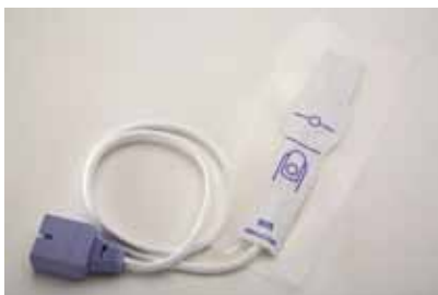
Oxisensor II (24/box) Adult 11996-000113 (18 in. - Ref# D25) 11996-000114 (36 in. - Ref# D25L) Pediatric 11996-000116 (18 in. - Ref# D20)