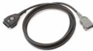
QUIK-COMBO Therapy Cable

With convenient TRUE-LOCK™ Cable Connector. Length is approximately 8 ft. For use with LIFEPAK 15 monitor/defibrillator.