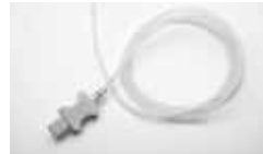
Esophageal-Rectal Temperature Sensor