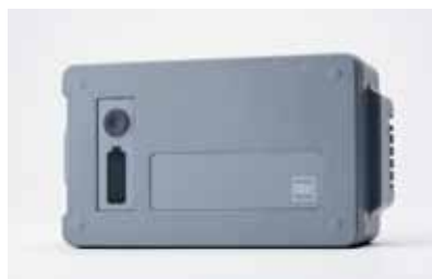
Lithium-ion Battery 5.7 Ah 5.7 amp hour, 11.1 volt, rechargeable, with fuel gauge. 21330-001176