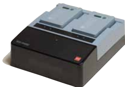
REDI-CHARGE Base AC power cord and adapter tray not included. 11141-000115