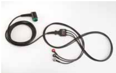
3-Wire ECG Cable Right-angle connector 11110-000029