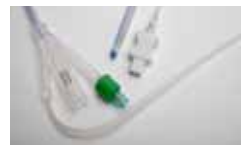
Foley Catheter Temperature Sensor

11996-000361 (1FR, 10/pk) 11996-000362 (16FR, 10/pk) 11996-000363 (18FR, 10/pk)