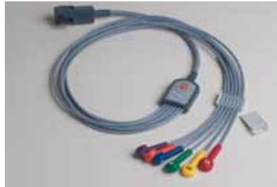
12-Lead ECG Cable 6-Wire Precordial Attachment 11111-000022