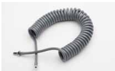
NIBP Tubing, Coiled