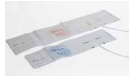
Single Patient Use Cuff