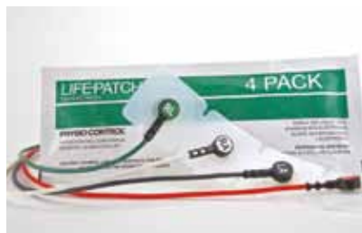
LIFE-PATCH ECG Electrodes Adult, pregelled. 11100-000002 (4/pk)