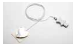
Skin Temperature Sensor