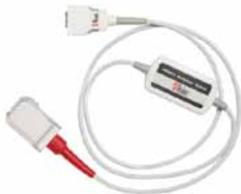
Red MNC Cable

Connects LIFEPAK 15 to Nellcor patient sensor 11996-000365 (4ft) 11996-000366 (10ft)