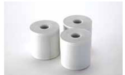
Box of Strip Chart Recorder Paper 100mm x 22m 11240-000016 (2 rolls/box)