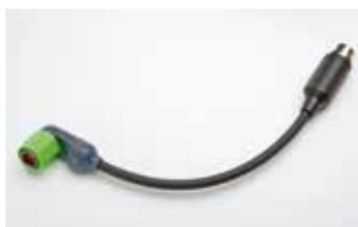
Replacement Right Angle Power Cable for AC/DC Power Adapter 11140-000081