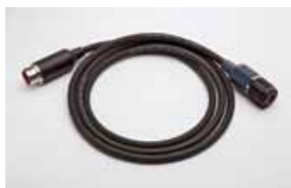
Extension Cable for AC/DC Power Adapter 11140-000080