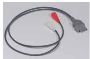
FAST-PATCH ® Adapter Cable For use with the QUIK-COMBO therapy cable for the LIFEPAK 12 defibrillator/monitor. 11110-000052