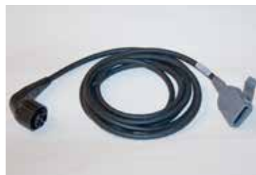
QUIK-COMBO Therapy Cable For use with the LIFEPAK 12 defibrillator/monitor. 11113-000040