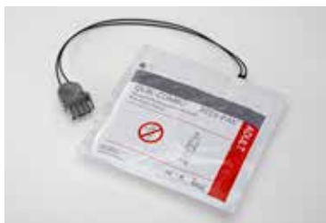
EDGE System Electrodes with QUIK-COMBO Connector and REDI-PAK ™ Preconnect System 11996-000017 (42" leadwire length)