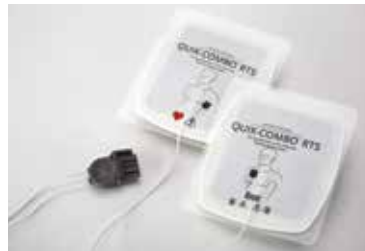
EDGE System RTS (Radiotransparent) Electrodes with QUIK-COMBO Connector 11996-000090 (24" leadwire length)