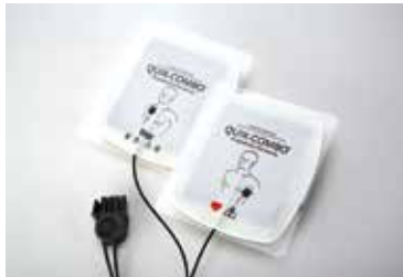
EDGE System Electrodes with QUIK-COMBO Connector 11996-000091 (24" leadwire length)

18 month minimum shelf life unless specified