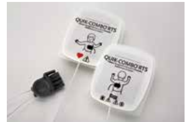
Pediatric EDGE System RTS Electrodes with QUIK-COMBO Connector For use only with manual monitor/defibrillators; 12 month minimum shelf life at time of shipment. 11996-000093 (24" leadwire length)