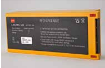
Rechargeable SLA Battery Pak 11141-000002