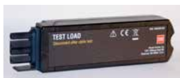
Test Load Use to perform therapy cable performance checks. Connects to the QUIK-COMBO therapy cable on the defibrillator. 21330-0013656