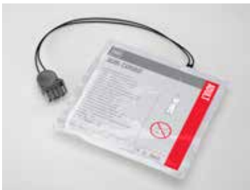
EDGE System™ Electrodes with QUIK-COMBO® Connector and REDI-PAK™ Preconnect System 11996-000017