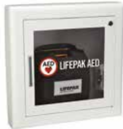
Semi-Recessed (3" Return)

11220-000083 (White) 11220-000084 (Stainless)