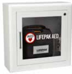
Surface Mount (7" Return)