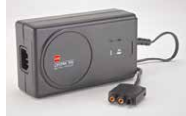
Battery Charger For use with LIFEPAK 500 AED rechargeable SLA Battery Pak. Power cord included. 11140-000002