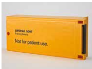
For LIFEPAK 500T Training System 11250-000006