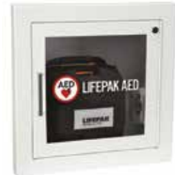
Recessed Mount (1.5" Return)