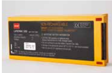
Non-rechargeable Lithium Sulfur Dioxide Battery Pak For use with the LIFEPAK 500 AED. Includes discharger and instructions on safe disposal of Battery Pak 11141-000158 (LIFEPAK 500 AED) 11141-000159 (LIFEPAK 500 DPS AED)