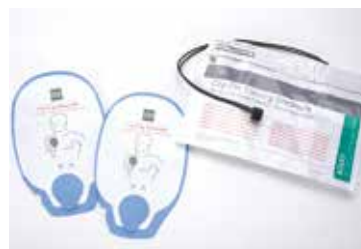
AED Training Electrode Set Consists of five (5) pair of reusable AED training electrodes, cable connector assembly, and reusable foil pouch. Reusable training electrodes good for 30 applications. 11101-000004 (Adult) 11101-000003 (Adult Replacement) 11250-000045 (Infant/Child) 11250-000042 (Infant/Child Replacement)