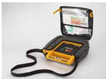
LIFEPAK 500T AED Training System Includes one (1) AED trainer, remote control and cable, simulated battery pak, training electrodes, carrying case (soft-sided, gray), AED instruction card, operating instructions, and batteries for AED trainer and remote control. 11250-000096 (English only)