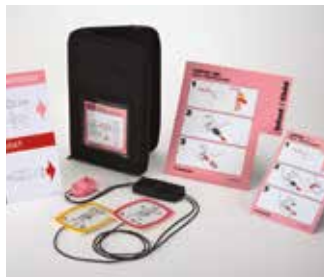
Infant/Child Reduced Energy Defibrillation Electrode Starter Kit For use only with LIFEPAK® 500 Biphasic AED with pink connector or LIFEPAK 1000 defibrillator, LIFEPAK EXPRESS® AED, or LIFEPAK CR® Plus AED. For use on children less than 8 years of age or under 55 lbs. 11101-000017 11101-000016 (Replacement)