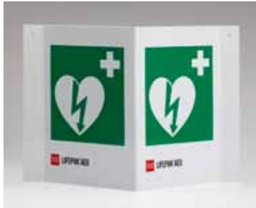
Tent ILCOR Location Sign 11998-000329 (w/logo, 7" x 8")