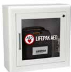
Surface Mount (7" Return)