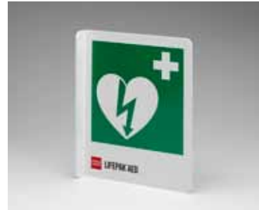
T-mount ILCOR Location Sign 11998-000327 (w/logo, 8" x 10")