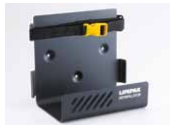
Wall Mount Bracket for LIFEPAK 1000 or LIFEPAK 500 Defibrillators