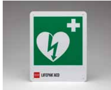
Flat ILCOR Location Sign 11998-000327 (w/logo, 8" x 10")