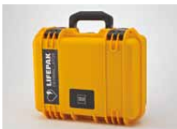
Hard-shell, Water-tight Carrying Case