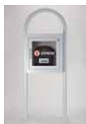
AED Floor Stand Cabinet with Alarm