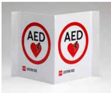
Tent AED Location Sign 11998-000332 (w/logo, 7" x 8")