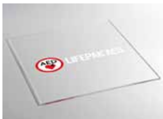
AED Cabinet Window Replacement Kit