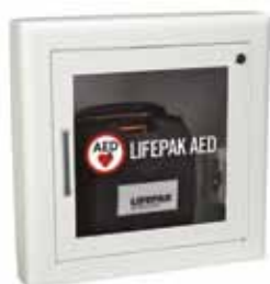
Semi-Recessed (3" Return)