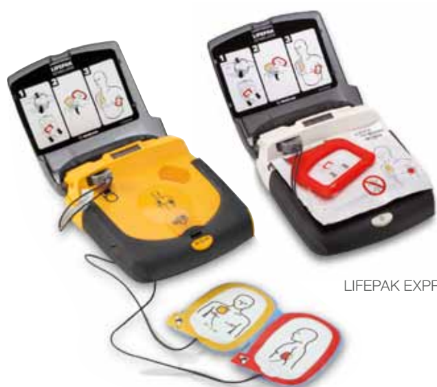
LIFEPAK EXPRESS AED

Ensure the safety of your staff and patients. Only Physio-Control accessories and disposables have been thoroughly tested with LIFEPAK products. Stick with the name you trust and the company that stands behind it. To order, contact your Physio-Control representative.