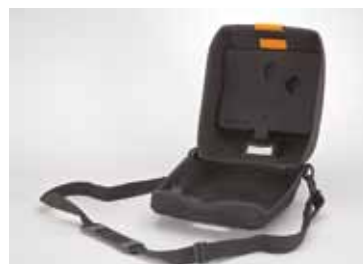
Complete Soft Shell Carrying Case