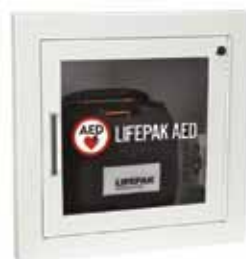
Recessed Mount (1.5" Return)