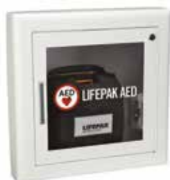
Semi-Recessed (3" Return)