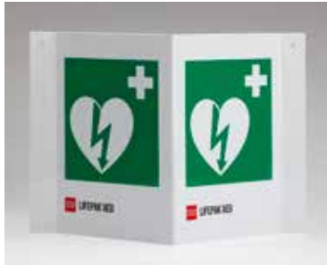
Tent ILCOR Location Sign 11998-000329 (w/logo, 7" x 8")