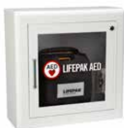
Surface Mount (7" Return)