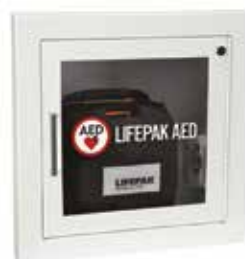
Recessed Mount (1.5" Return)