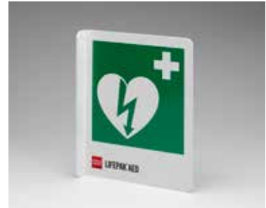
T-mount ILCOR Location Sign 11998-000327 (w/logo, 8" x 10")