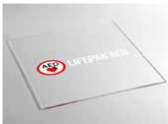
AED Cabinet Window Replacement Kit