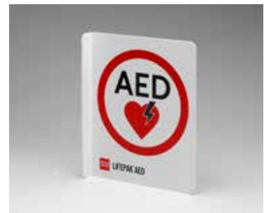
T-mount AED Location Sign 11998-000331 (w/logo, 8" x 10") 11998-000333 (w/o logo, 8" x 10")