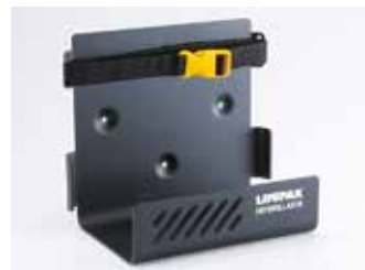
Wall Mount Bracket for LIFEPAK 1000 or LIFEPAK 500 Defibrillators