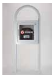
AED Floor Stand Cabinet with Alarm