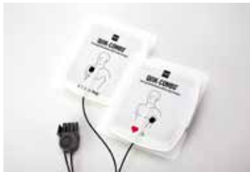
EDGE System Electrodes with QUIK-COMBO Connector 11996-000091 (24" leadwire length)

18 month minimum shelf life unless specified