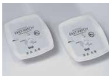
EDGE System Electrodes with FAST-PATCH Connector Must be used with QUIK-COMBO to FAST-PATCH Adapter Cable (11110-000052) 11996-000092