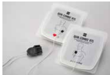
EDGE System RTS (Radiotransparent) Electrodes with QUIK-COMBO Connector 11996-000090 (24" leadwire length)