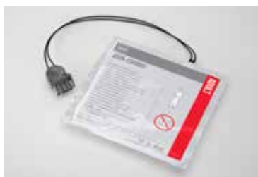
EDGE System Electrodes with QUIK-COMBO Connector and REDI-PAK ™ Preconnect System 11996-000017 (42" leadwire length)