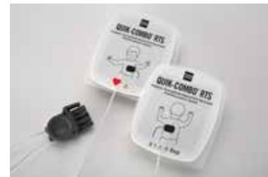
Pediatric EDGE System RTS Electrodes with QUIK-COMBO Connector For use only with manual monitor/defibrillators; 12 month minimum shelf life at time of shipment. 11996-000093 (24" leadwire length)