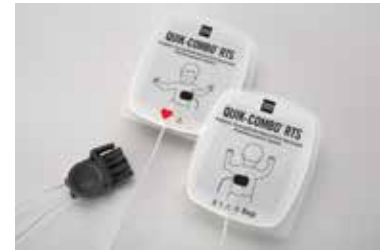
Pediatric EDGE System RTS Electrodes with QUIK-COMBO Connector For use only with manual monitor/defibrillators; 12 month minimum shelf life at time of shipment. 11996-000093 (24" leadwire length)