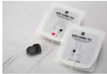
EDGE System RTS (Radiotransparent) Electrodes with QUIK-COMBO Connector 11996-000090 (24" leadwire length)