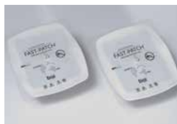
EDGE System Electrodes with FAST-PATCH Connector Must be used with QUIK-COMBO to FAST-PATCH Adapter Cable (11110-000052) 11996-000092