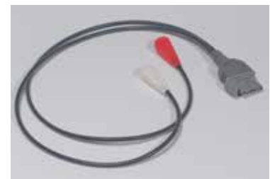
FAST-PATCH ® Adapter Cable For use with the QUIK-COMBO therapy cable for the LIFEPAK 12 defibrillator/monitor. 11110-000052