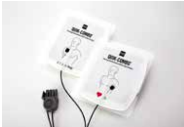
EDGE System Electrodes with QUIK-COMBO Connector 11996-000091 (24" leadwire length)

18 month minimum shelf life unless specified