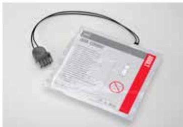
EDGE System Electrodes with QUIK-COMBO Connector and REDI-PAK ™ Preconnect System 11996-000017 (42" leadwire length)