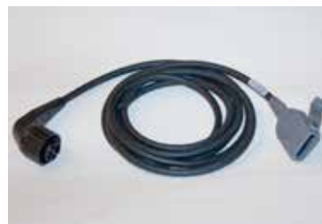
QUIK-COMBO Therapy Cable For use with the LIFEPAK 12 defibrillator/monitor. 11113-000040