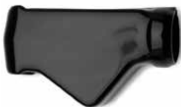
Reusable Ambient Light Shield 11171-000054 (5/bag)