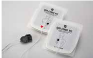
EDGE System RTS (Radiotransparent) Electrodes with QUIK-COMBO Connector