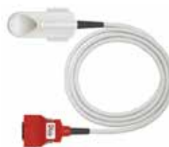
Pediatric Rainbow Direct Connect Reusable Sensor 11996-000337 (3ft) 11171-000033 (8ft) 11996-000338 (12ft)