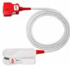
Adult Reusable Direct Connect Sensor 11996-000331 (3ft) 11996-000332 (12ft)