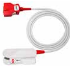
Adult Rainbow Direct Connect Reusable Sensor 11996-000335 (3ft) 11171-000032 (8ft) 11996-000336 (12ft)