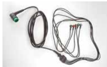
5-Wire ECG Cable

4-wire limb plus 1 chest lead, labeled "V1" on the monitor reports. 11110-000066 (AHA) 11110-000067 (IEC)