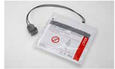
EDGE System Electrodes with QUIK-COMBO Connector and REDI-PAK™ Preconnect System