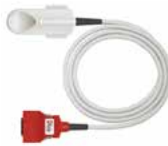
Pediatric Reusable Direct Connect Sensor 11996-000333 (3ft) 11996-000334 (12ft)