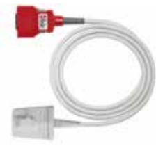
Adult Reusable Soft Direct Connect Sensor 11171-000053 (8ft)