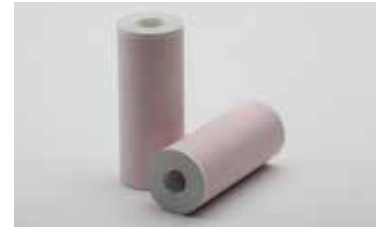
Chart Recorder Paper

4-wire limb plus 1 chest lead, labeled "V1" on the monitor reports. 11110-000066 (AHA) 11110-000067 (IEC)