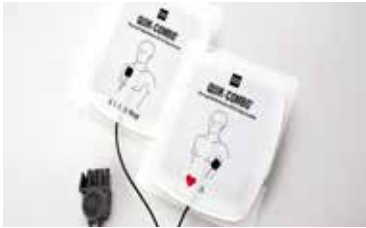
EDGE System Electrodes with QUIK-COMBO Connector

18-month minimum shelf life remaining at time of shipment from Physio-Control except where noted.