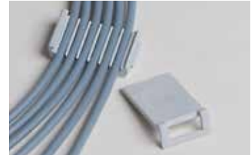
4-wire Cable Comb