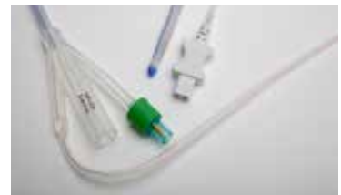
Foley Catheter Sensor