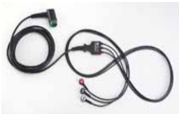
3-Wire ECG Cable