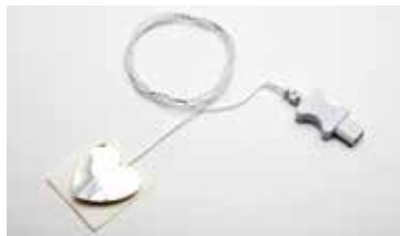
Skin Probe Sensor