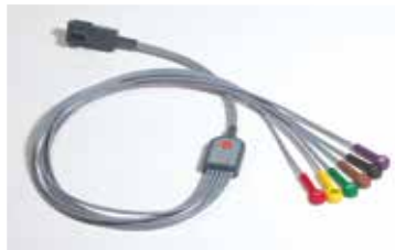
12-Lead ECG Cable 6-Wire Precordial Attachment

11111-000018 (5ft, AHA) 11111-000019 (5ft, IEC) 11111-000020 (8ft, AHA) 11111-000021 (8ft, IEC)