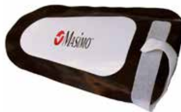
Disposable Ambient Light Shield 11171-000055 (10/bag)