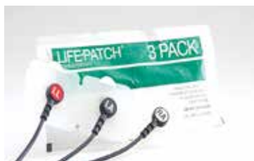
LIFE•PATCH® ECG Electrodes

100mm x 22m 11240-000016 (2 rolls per box)