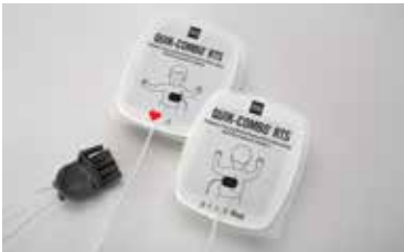
Pediatric EDGE System RTS Electrodes with QUIK-COMBO Connector

For use only with manual monitor/defibrillators; 12 month minimum shelf life at time of shipment 24" leadwire length.