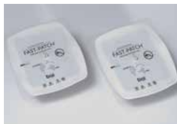
EDGE System Electrodes with FAST-PATCH Connector Must be used with QUIK-COMBO to FAST-PATCH Adapter Cable (11110-000052) 11996-000092