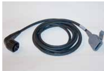
QUIK-COMBO Therapy Cable For use with the LIFEPAK 12 defibrillator/monitor. 11113-000040