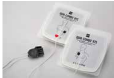
EDGE System RTS (Radiotransparent) Electrodes with QUIK-COMBO Connector 11996-000090 (24" leadwire length)