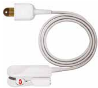
LNOP Reusable Sensor