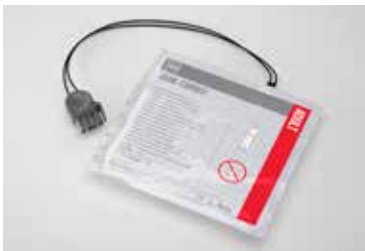
EDGE System Electrodes with QUIK-COMBO Connector and REDI-PAK ™ Preconnect System 11996-000017 (42" leadwire length)