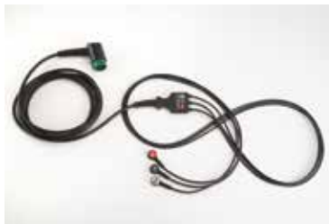
3-Wire ECG Cable

Right-angle connector 11110-000029 (AHA) 11110-000030 (IEC)