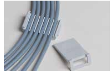
4-wire Cable Comb 21300-008054 (10/pk)