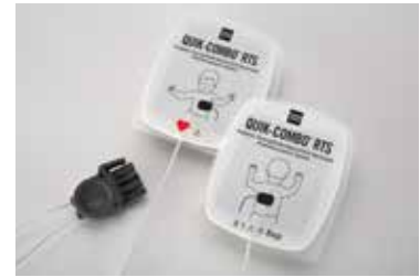
Pediatric EDGE System RTS Electrodes with QUIK-COMBO Connector For use only with manual monitor/defibrillators; 12 month minimum shelf life at time of shipment. 11996-000093 (24" leadwire length)