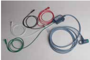
12-Lead ECG Cable Trunk Cable with 4-Wire Limb Leads

11111-000018 (5ft AHA) 11111-000019 (5ft IEC) 11111-000020 (8ft AHA) 11111-000021 (8ft IEC)