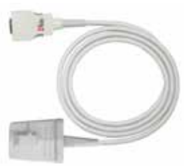
Direct Conect Reusable Soft Sensor 11171-000051 (Ad)