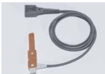
DURA-Y Multisite Reusable Sensor 11996-000106 (> 1 kg)