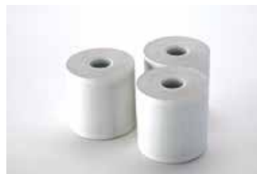
Strip Chart Recorder Paper

Adult, pregelled. (Not available in the European Union.) 11100-000002 (4/pk) 11100-000001 (3/pk)