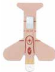
LNOP Adhesive Sensor (20/box)