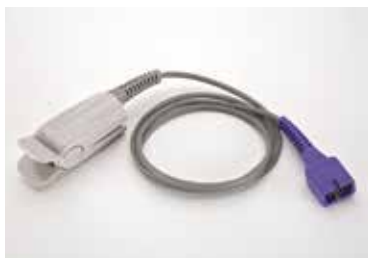
DURASENSOR Reusable Clip 11996-000060 (Ad)