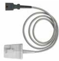
LNCS Reusable Soft Sensor 11171-000052 (Ad)