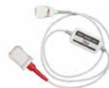
MNC-1 Adapter Cable

Allows LIFEPAK 12 defibrillator/monitor with Masimo SpO 2 to connect to Nellcor sensors.