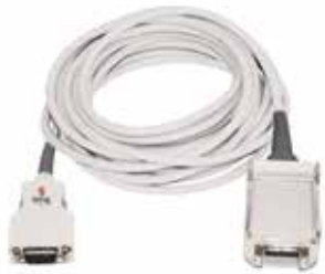
LNCS Patient Cable 11171-000024 (4ft) 11171-000016 (10ft) 11171-000025 (14ft) 11171-000027 (4ft extension)