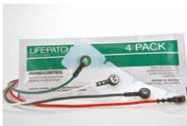
LIFE-PATCH ECG Electrodes

Adult (Available in the European Union.) 1700-003 (3/pk)