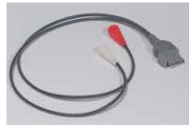
FAST-PATCH ® Adapter Cable For use with the QUIK-COMBO therapy cable for the LIFEPAK 12 defibrillator/monitor. 11110-000052