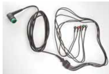
5-Wire ECG Cable

Right-angle connector 11110-000029 (AHA) 11110-000030 (IEC)