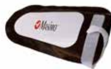
Disposable Ambient Light Shield