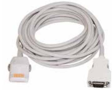
LNOP Patient Cable