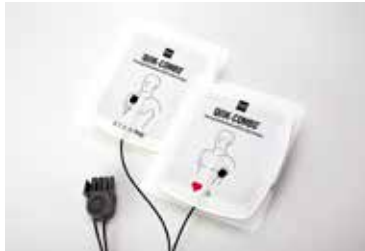
EDGE System Electrodes with QUIK-COMBO Connector 11996-000091 (24" leadwire length)

18 month minimum shelf life unless specified