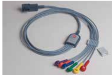
12-Lead ECG Cable 6-Wire Precordial Attachment

11111-000018 (5ft AHA) 11111-000019 (5ft IEC) 11111-000020 (8ft AHA) 11111-000021 (8ft IEC)