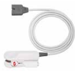
LNCS Reusable Sensor 11171-000017 (Ad) 11171-000018 (Ped)