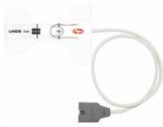
LNCS Adhesive Sensor Single Patient Use. (20/box) 11171-000019 (Ad) 11171-000019 (Ped) 11171-000029 (Neo/Pt) 11171-000028 (Neo/Ad) 11171-000031 (Inf)